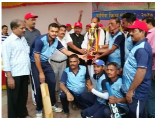
Vaze College Cricket Team receiving the Runner's Up Trophy in Cricket at K.M. Agarwal College, Kalyan