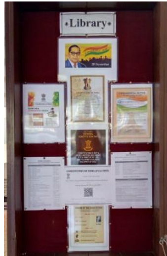
24-Nov-2017 to 01-Dec-2017: Information on 'Constitution of India'