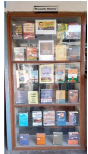
24-Nov-2017 to 29-Nov-2017: Books on 'Constitution of India'