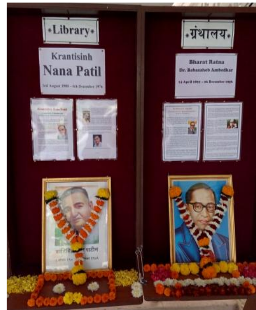
06-December-2017 Death Anniversary of Krantsinh Nana Patil and Dr. Babasaheb Ambedkar