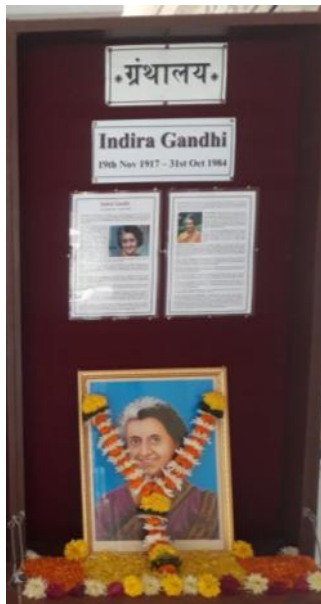
19-November-2017 Birth Anniversary of Indira Gandhi