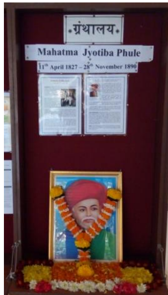
28-November-2017 Death Anniversary of Mahatma Jyotiba Phule