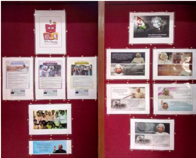
12-Oct-2017 to 14-Nov-2017: Dr. A P J Abdul Kalam's Quotations